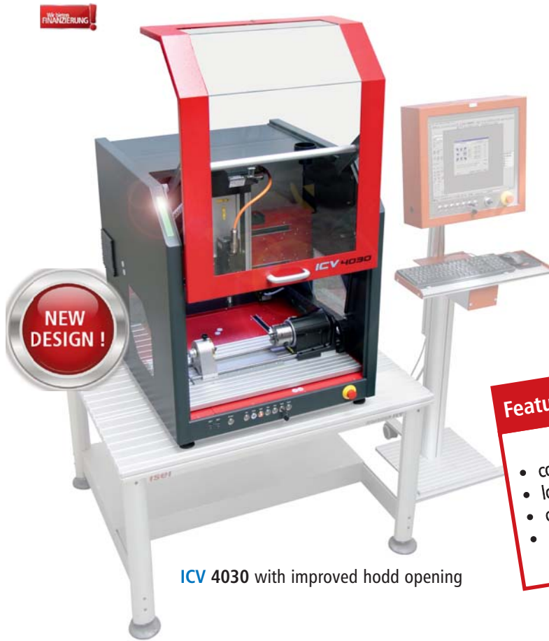
ICV 4030 with improved hodd opening