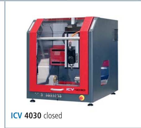
ICV 4030 closed