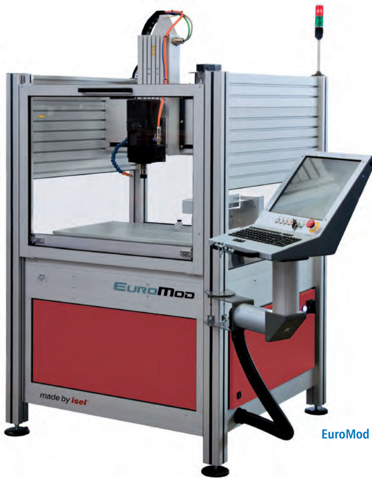
EuroMod MP 30 with closed sliding door